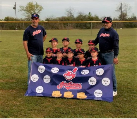
2019 Indians Tee Ball Team